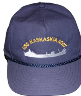
USS KASKASKIA AO27 Ballcap

Terry Gacioch has several USS KASKASKIA (AO 27) related items for sale. Terry has hats and a limited number of charms and pins from past reunions. The hats are $10.00 plus $2.00 postage and the charms and pins are $5.00 plus $2.00 postage. See the website for pictures of all of the charms available. Order your new hats from Terry at the address listed above.