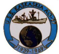
USS KASKASKIA AO27 pin