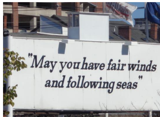
Portland ME hotel sign from 2018 convention