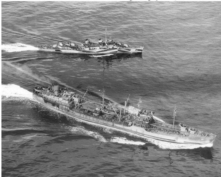
Photo # 19-N-294653 USS Kaskaskia and USS Hart during refueling experiments, December 1944