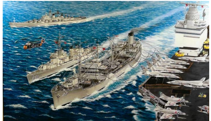
Cuban Blockade, October 1962 KASKASKIA, ENTERPRISE, USS HARWOOD (DD 861) and USS CANBERRA (CAG 2) during underway replenishment.