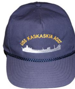
USS KASKASKIA AO27 Ballcap