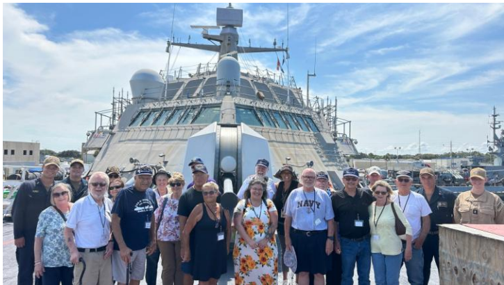
Above-KASKASKIA Reunion families gathered on the forecastle of LCS 17 for group photo. Right- Group photo during harbor tour of St. Augustine, Florida