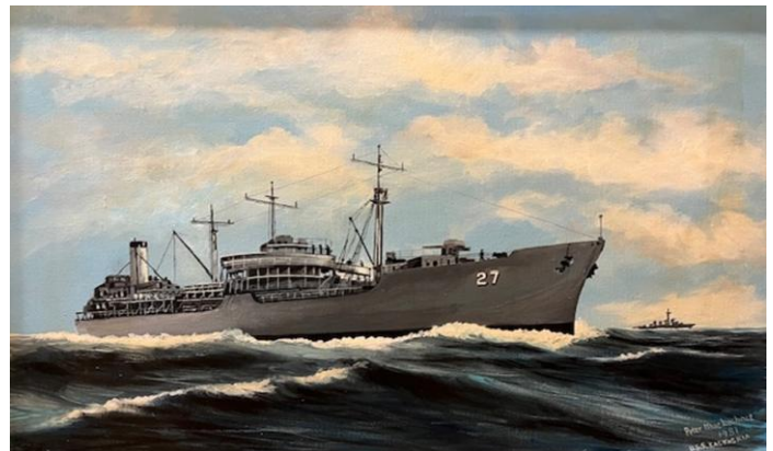
USS KASKASKIA (AO 27) on horizon, USS SABINE (AO 25) our Mayport, Florida sister ship.