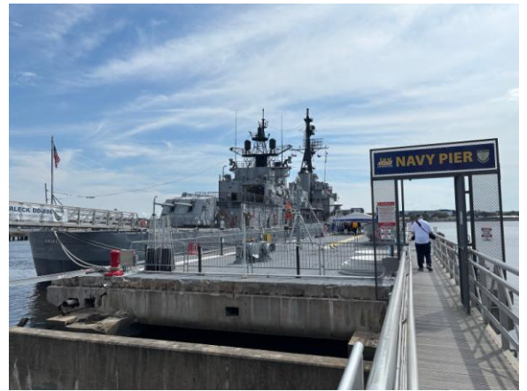
Museum Ship Ex-USS ORLECK (DD 886) Located in downtown Jacksonville