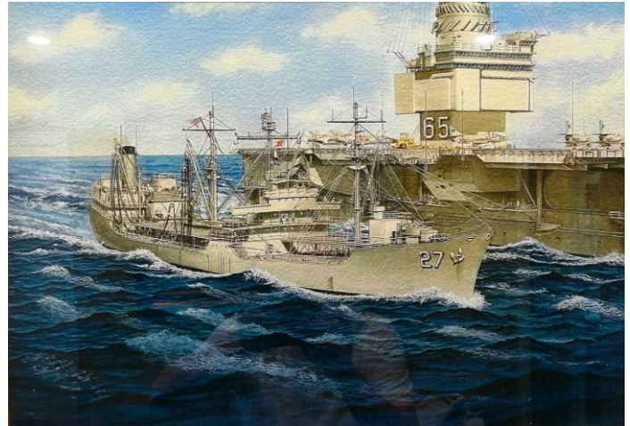
October 1992 USS KASKASKIA (AO 27) and USS ENTERPRISE (CVN 65) UNREP off the coast of Cuba